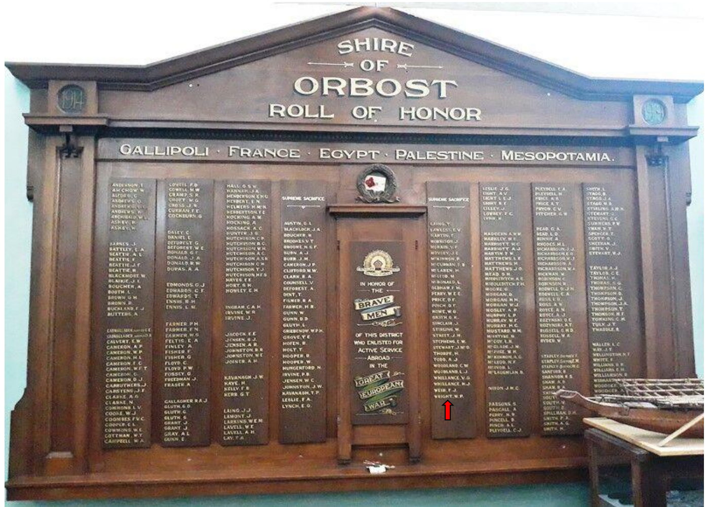
Shire of Orbost Roll of Honour