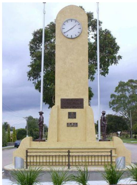
Orbost War Memorial / Memorial Clock Tower

The Orbost War Memorial / Memorial Clock Tower, located at Salisbury & Nicolson Streets, Orbost, Victoria does not have individual names.