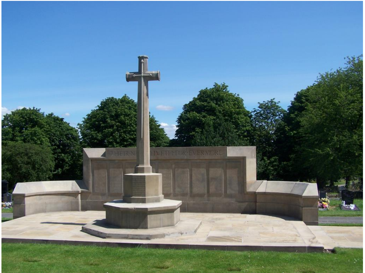
Cross of Sacrifice & Screen Wall